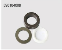
#26.BM18 Main Water Seal

NOTES: 01 WATER SEAL KIT ITEM#24+ITEM#26